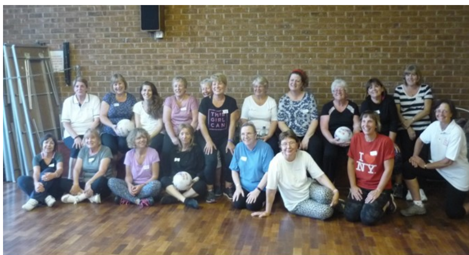
Maidenhead WI Group, Berkshire

More WI groups are due to start their sessions soon in the other South counties.