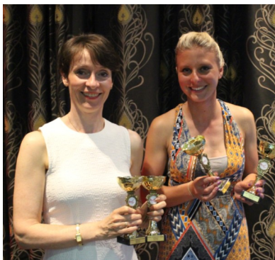
U19 League Winners—Clan