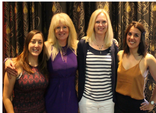
Division 3 Winners—Swan Centre