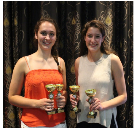
U16 League Winners—Weston Park Blades