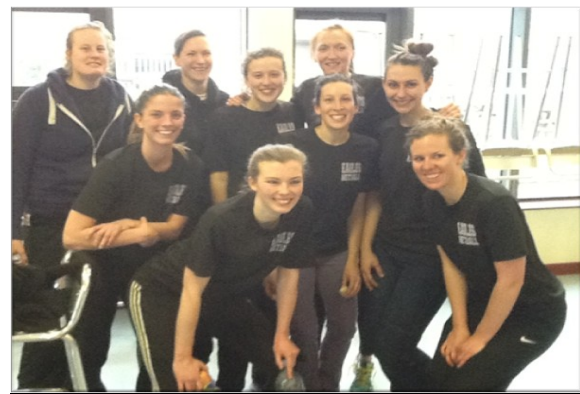
Division 1 Winners—Eagles