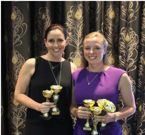
U13 League Winners—Bucks Phoenix