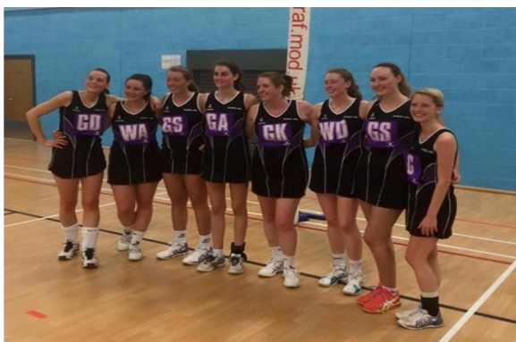
Division 2 Winners—Sussex Tigers