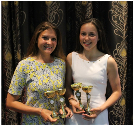
U14 League Winners—Royals