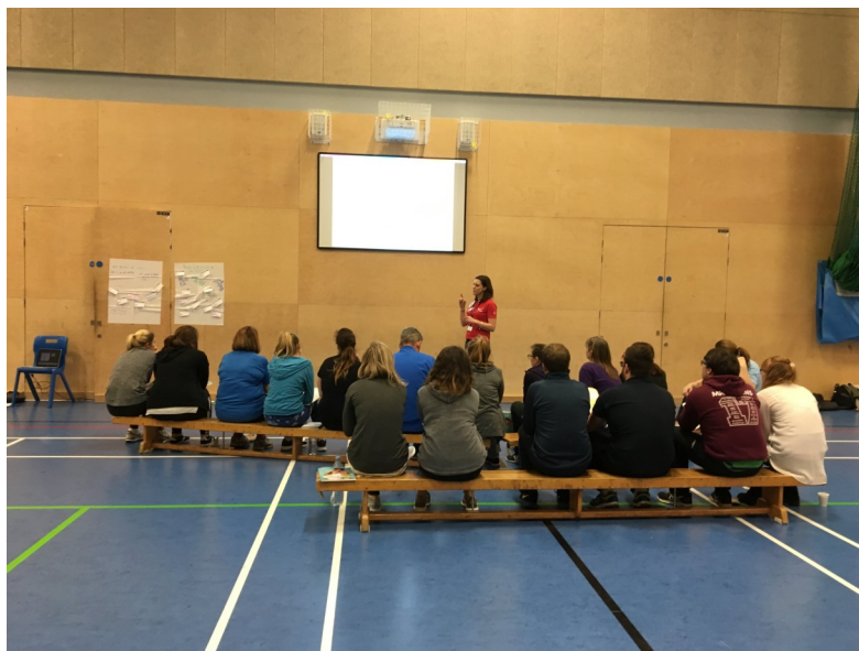
Learners at the High 5 Workshop in Aylesbury

For more information and to find a CPD course near you, visit: