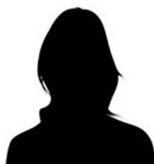
VACANT Berkshire & Oxfordshire NDO